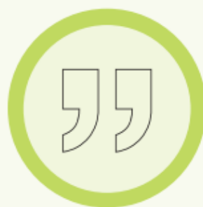
Conventions of language (spelling, grammar and punctuation)