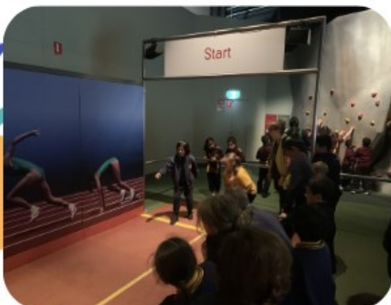
Ready at the strating line!

I liked watching the movie in the planetarium because the robot was very funny!- Akeesha 1A