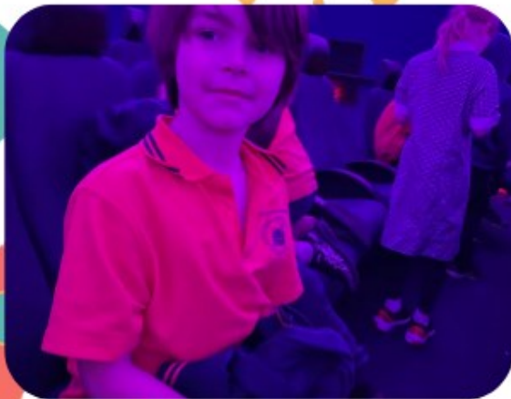
Our orange shirts in the planetarium