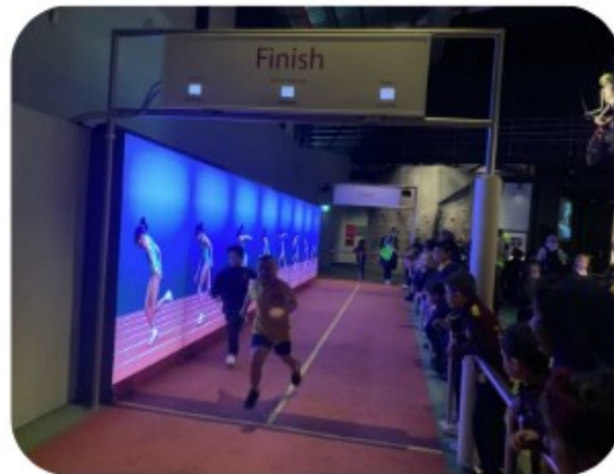
Racing against Cathy Freeman!

On Wednesday the 3 rd of September, all 70 grade 1 and 2 students eagerly boarded the buses with 8 teachers and ES staff to go on our spectacular Scienceworks excursion! When we arrived, we had a snack break before embarking on our exploration of the exhibits - 'Think ahead' and 'Sportworks'.