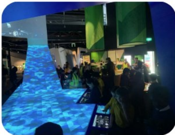
Building cars in the future!